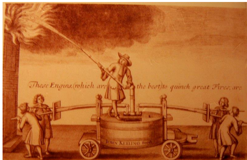
A picture of a small, early fire engine occasionally used in the 17 th Century.