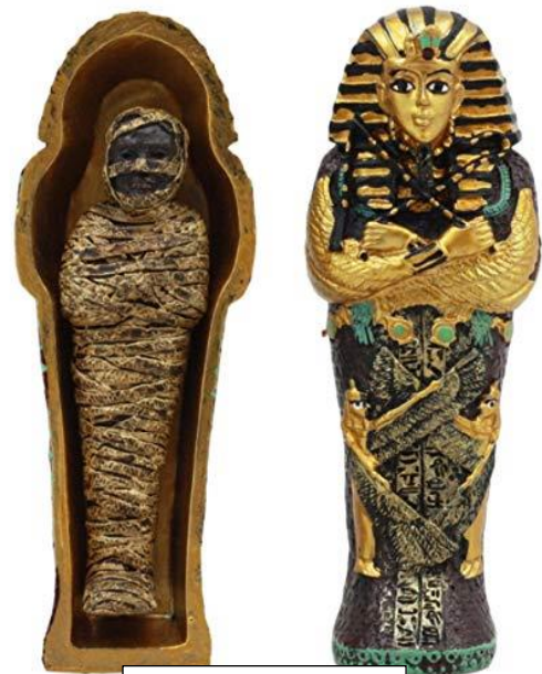
An Egyptian sarcophagus

When unwrapped, the bandages of an ancient Egyptian mummy could stretch for over 1600 metre (1.6km).