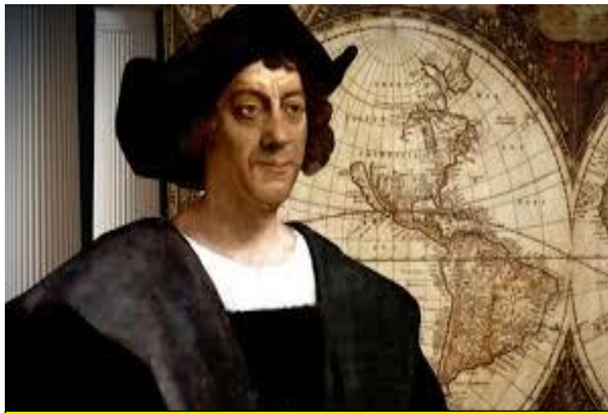
Christopher Columbus (sailor)