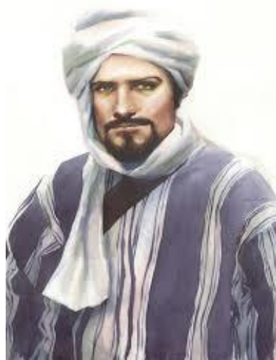
Ibn Battuta (explorer)

Famous for - Being the first person to step foot onto the moon as part of the Apollo 11 mission. The journey took just over 3 days. Edwin (Buzz) Aldrin and Michael Collins were two other astronauts on this mission.